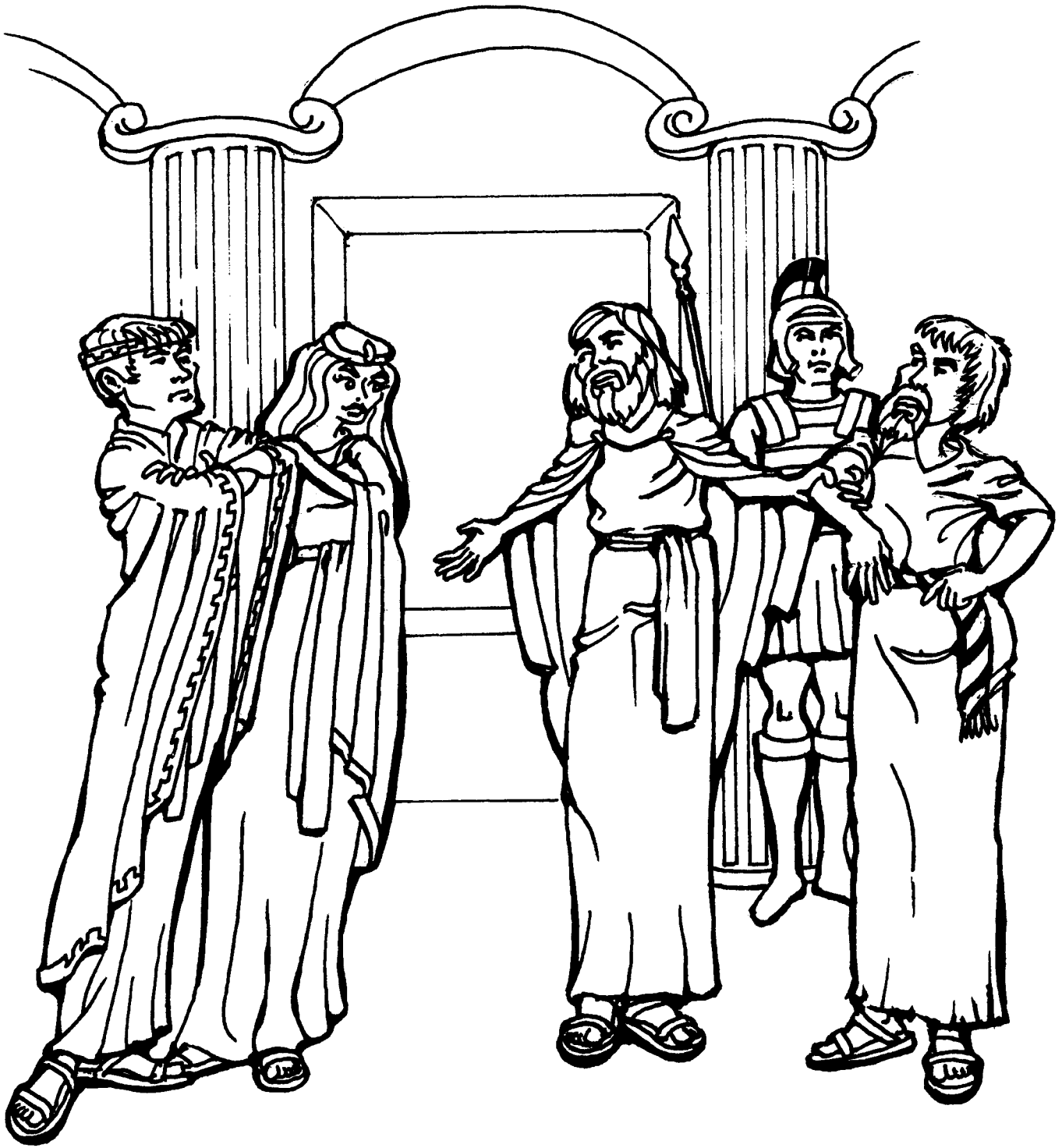
"Paul is brought before King Agrippa." Acts 25:13–26:32