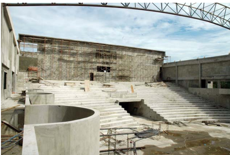
Picture above shows the auditorium under construction.

It is God who gives us the power to get wealth to establish His covenant