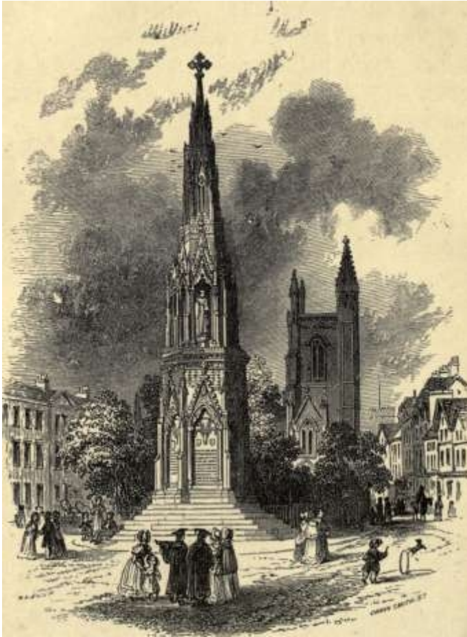
NICHOLAS RIDLEY: BISHOP AND MARTYR. 225

indeed appeared well; for after his legs were consumed, by reason of his struggling through the pain (whereof he had no release but only his contentation in God) he shewed that side towards us clean, shirt and all untouched with flame. Yet in all this torment he forgot not to call unto God still, having in his mouth, " Lord, have mercy upon me, ' intermingling his cry. ' Let the fire come unto me, I cannot burn.' In which pangs he laboured till one of the standers by with his bill pulled off the faggots above, and where he saw the fire flame up, he wrested himself unto that side. And when the flame touched the gunpowder, he was seen to stir no more, but burned on the other side, falling down at Master Latimer's feet; which, some said, happened by reason that the chain loosed; others said, that he fell over the chain by reason of the poise of his body, and the weakness of the nether limbs.