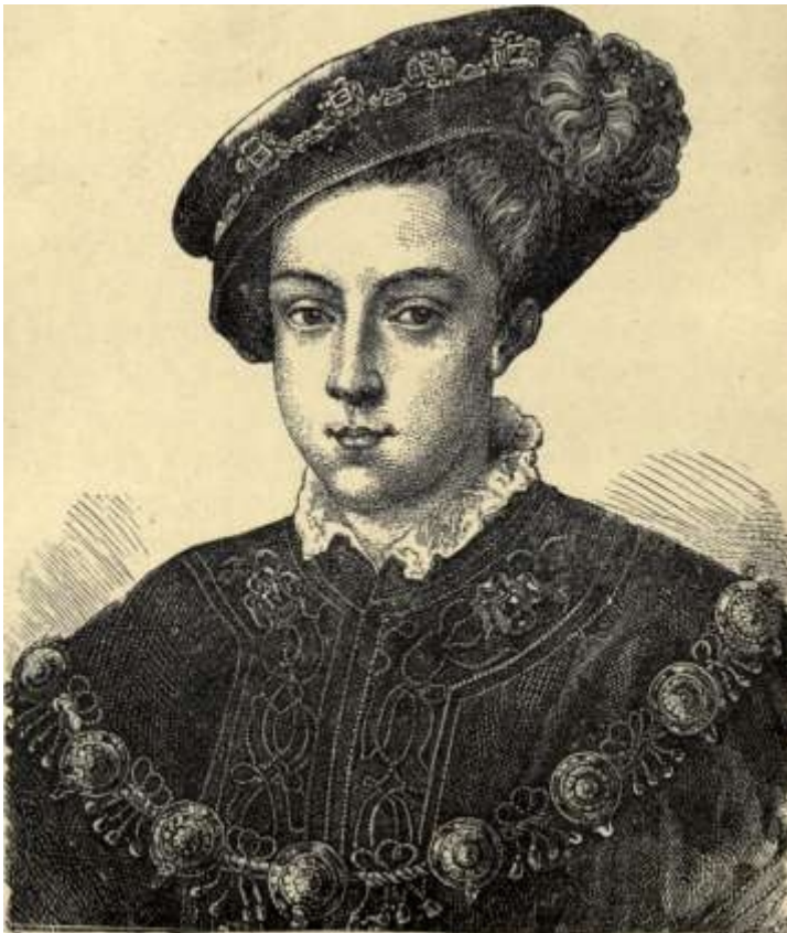
KING EDWARD VI.

Why was the speaker of these words not cast out of the Church of England ? Why was he not reprimanded ? Why was he not reviled as a man of low, unchurchman-like opinions? Why was he not proceeded against and