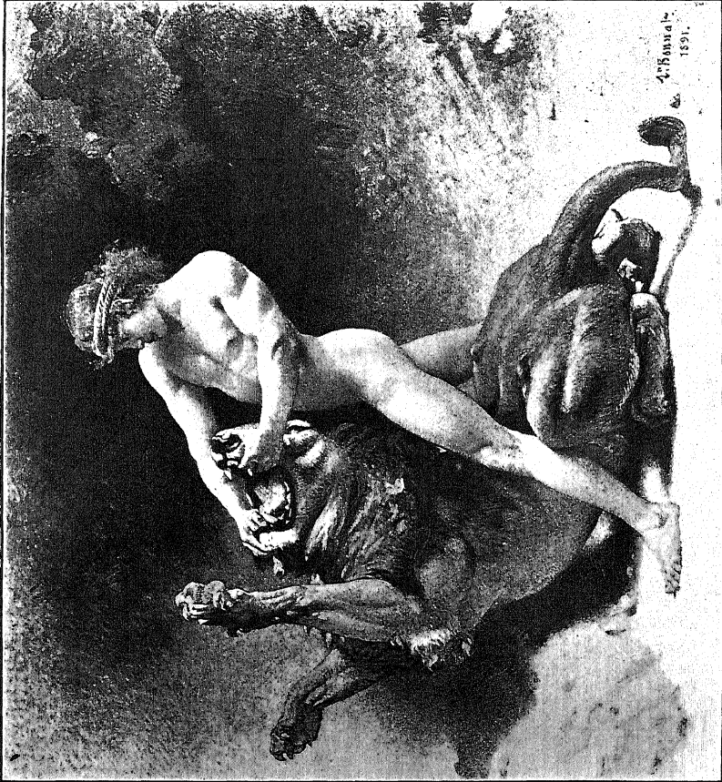
SAMSON RENDING THE LION