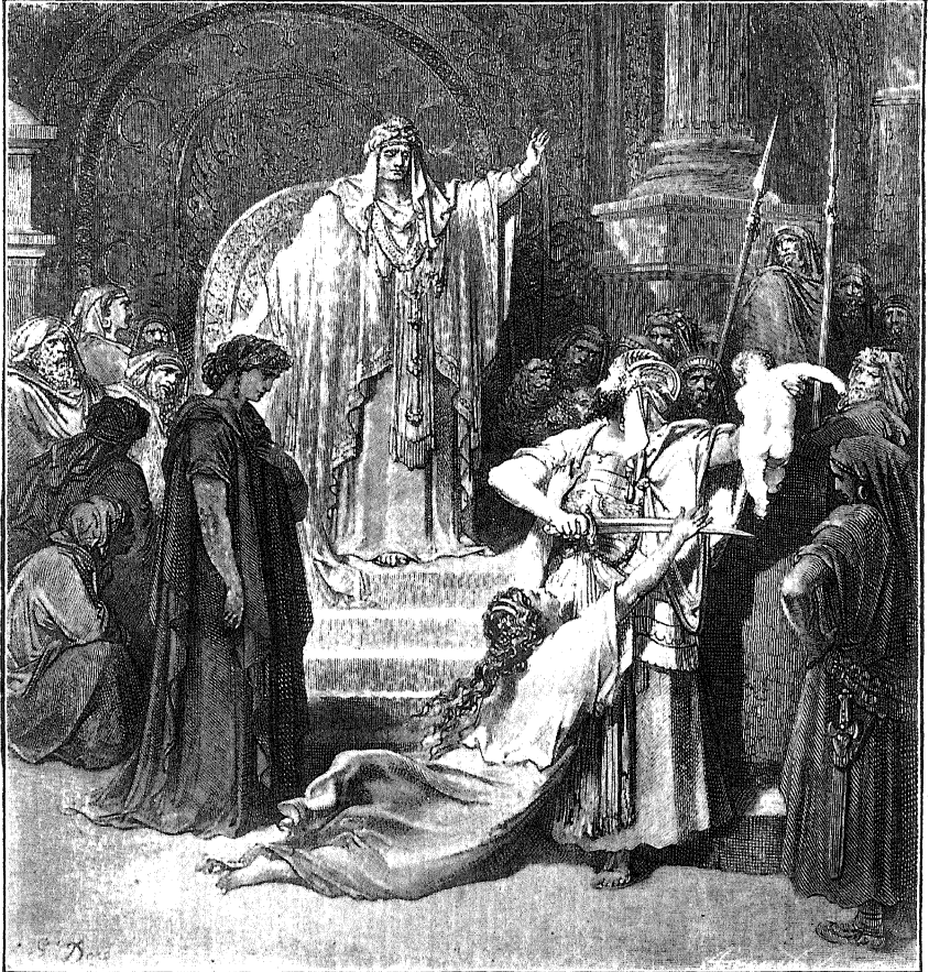
THE JUDGMENT OF SOLOMON