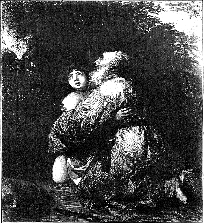
ABRAHAM AND ISAAC HEAR THE ANGEL'S VOICE