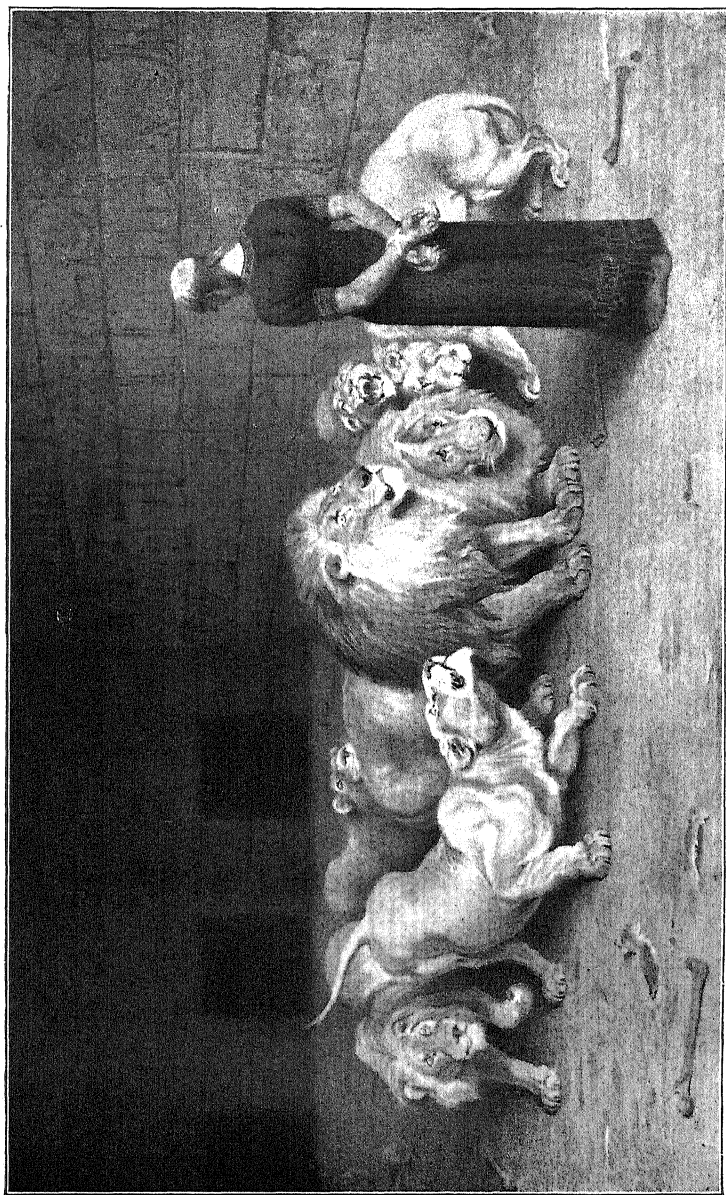
DANIEL IN THE DEN OF LIONS