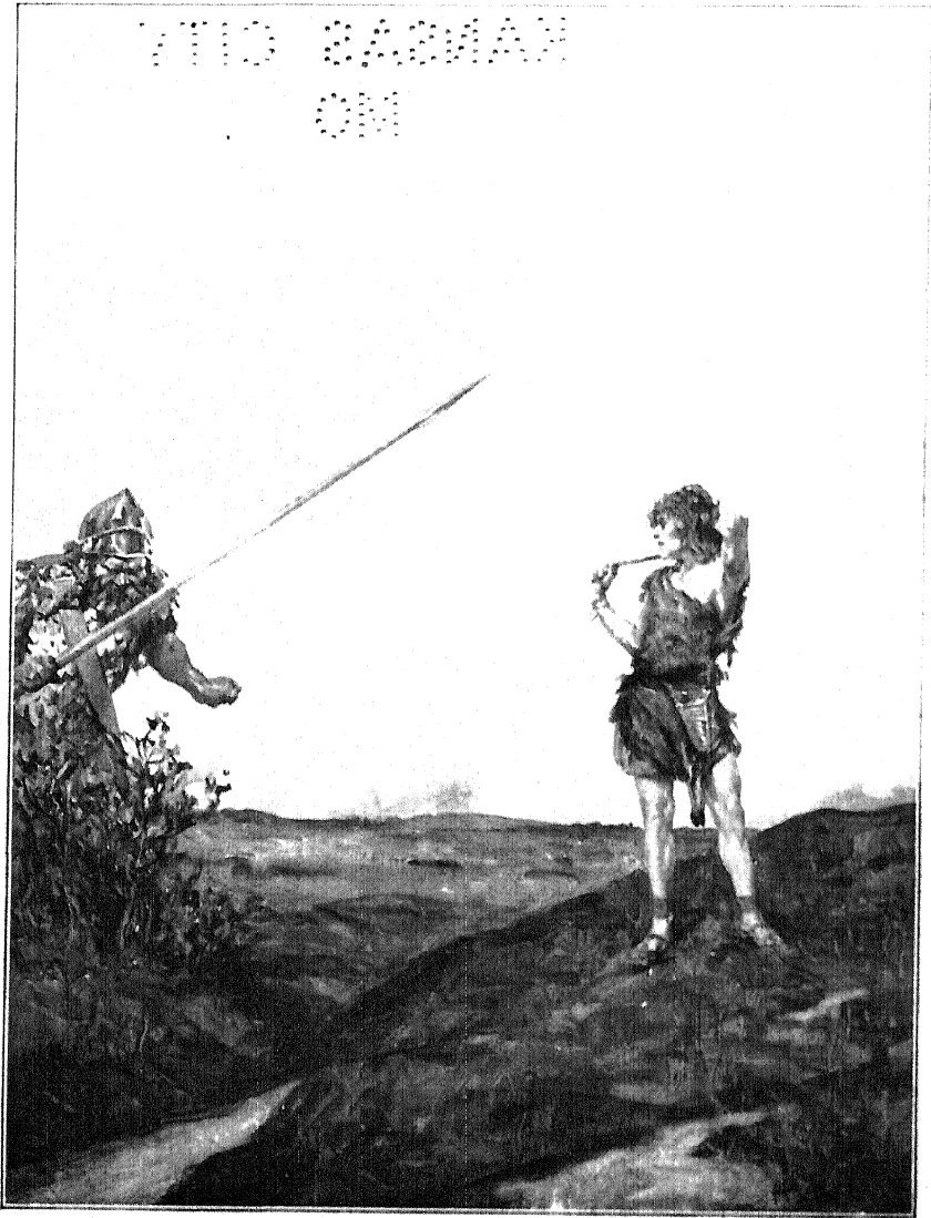
DAVID AND GOLIATH