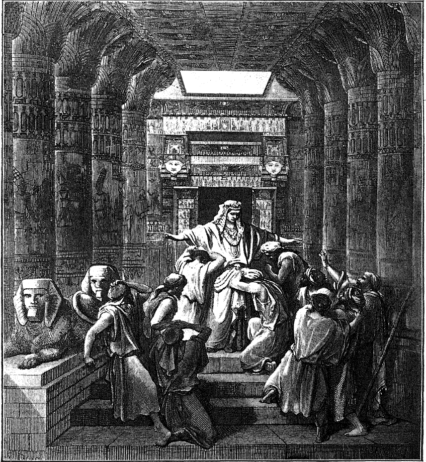
JOSEPH MAKING HIMSELF KNOWN TO HIS BRETHREN