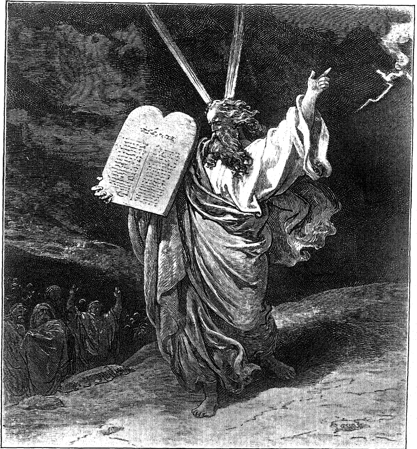
MOSES COMING DOWN FROM MT. SINAI